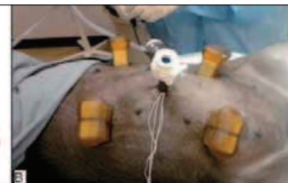
Figure 1: A: schematic representation of a magnetic anchoring and guidance system platform (MAGS). A- Conventional trocar B- MAGS camera C- retractor D- cautery element E- external magnets. B: External neodymium-iron-boron (NFeB) hand held magnets (orange) used in a pig model.

devices become more advanced and contribute more significantly to the operation, further instruments could be removed from the single port site thereby facilitating triangulation and decreasing instrument collisions.