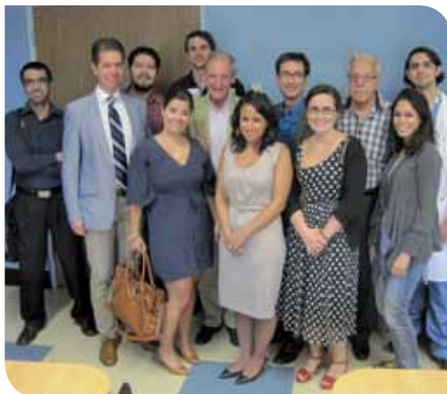
Photo 9: Participating in the residents' clinical case presentations, Department of Urology, The University of Montreal.

Our team also actively participated in clinical case discussions presented by the fellows and residents of the department (Photo 9). At the end of the session, each of us gave a brief presentation about the EAU, its structure, goals, achievements and collaboration with our national urological associations.