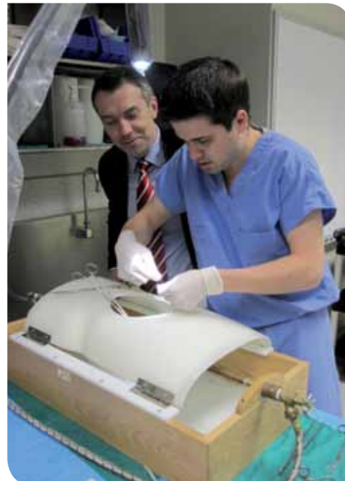
Photo 4: Annual testing of residents' surgical skills, Department of Urology, The Dalhousie University, Halifax. A resident attempts to close a vascular injury under persisting outflow on a model in the lab.