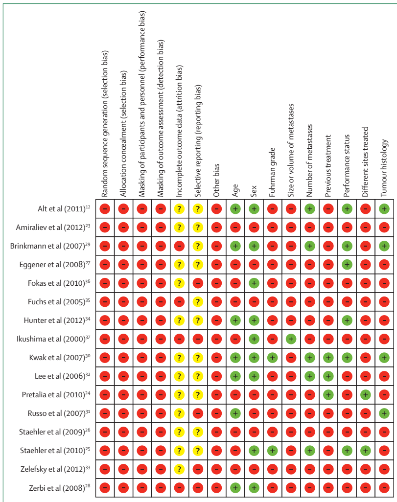
Figure 3: Risk of bias and confounding assessment summary Green circle=low risk of bias and confounding. Red circle=high risk of bias and confounding. Yellow circle=unclear risk of bias and confounding.

improvement in 2-year intracerebral control was found when adding WBRT to SRS compared with SRS alone (p=0.032), but no such difference was noted for 2-year overall survival (p=0.703); both were superior to WBRT alone in the general study population (all p<0.001) and in the RPA subgroup analyses (all p<0.001). In a subgroup analysis of RPA class I, the comparison of SRS with SRS plus WBRT revealed significantly better 2-year overall survival and intracerebral control for the combination group (p<0.001 for both). The other study 37 compared fractionated stereotactic radiotherapy (FSRT) with metastasectomy plus CRT, or CRT alone. Only six (55%) patients after metastasectomy plus CRT and four patients (33%) after CRT were followed up with imaging. Several of the patients in all groups underwent alternative surgical and non-surgical treatments after initial treatment. Survival at 1, 2, and 3 years were 90%, 54%, and 41% for FSRT, 64%, 27%, and 9% for metastasectomy