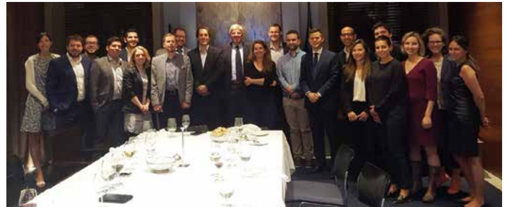
The first day was concluded with a wonderful dinner and the presentations of CHUM residents and our own